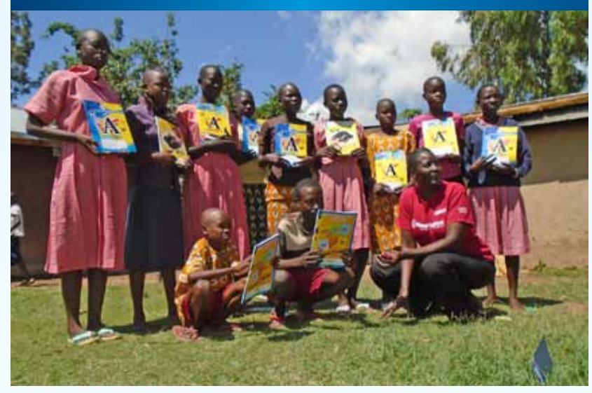
The mango tree orphan support trust (Kenya)

t is common place in the African society to extend a helping hand to support members of the extended family. This is particularly so when both parents die and leave young children to fend for themselves. But the traditional strength is collapsing across the continent as too many children are left orphans following the death of both their parents due to the dreaded HIV/AIDS scourge. The result is that whole families are dragged too far below the poverty line. Severe malnutrition, preventable diseases and infant mortality rates increases. School attendance rates and performance take a nosedive.