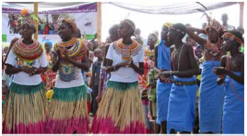
Children from Gabra, Turkana, Samburu, El Molo and Rendille Communities engaging in songs, traditional dances, poems and skits with the theme of Peace and Conflict during Inter Community Children Peace Concert in Marsabit County

Members of neighboring communities have established different economic activities like crossbreeding animals and farming where members from Samburu and Pokot communities work in each other's farm. Neighboring community members have been able to access social amenities like hospitals, schools and market as a result of interactions and friendship. During one of the inter community parents exchange program between Gabra and Rendille communities, gifts such as clothing, animals and artifacts worth over Ksh 136,000 was voluntarily exchanged.