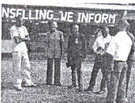
Time to see the far we come

Tangaza College managed to take the second highest number (17 students) after the hosts who had 104 attendees.