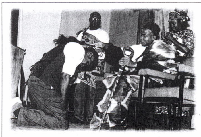
Initiating the New Students to the College life in the African way. (August 2003)

The Institute is also looking into the possibility of developing a degree to follow on the diploma. It is now considering a number of options and possibilities.