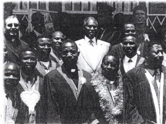
A Section of Graduates 2003

The Institute of Social Communication began operating as an "Institute" from the start of this current academic year. It has about 19 students in the first year. The proposal for a Bachelor of Arts in Social Communication to be offered under the Faculty of Social Sciences of CUEA is now being finalised. The Institute has been actively involved in preparing and launching the Tangaza web page and in the Waumini Radio services (National Catholic Radio Services).