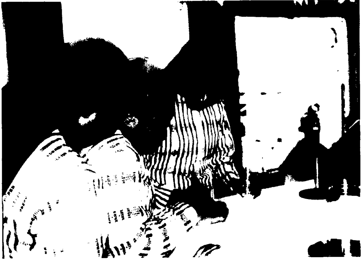
A Sister Signing her Formula of Vows.