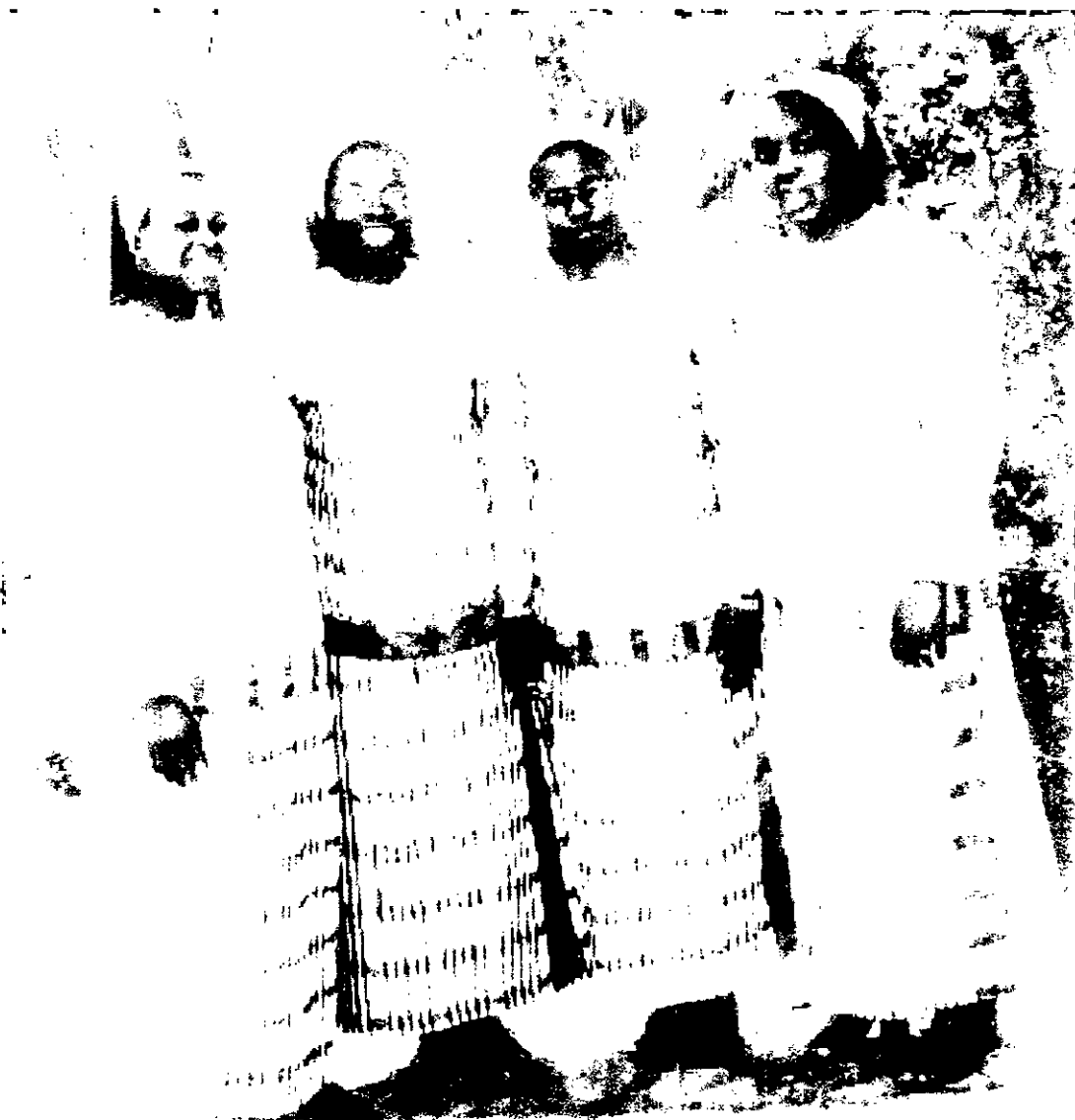
The Official Habit of the Sisters of the Sacred Heart of Jesus.

elevating it to God, spiritual incense that rises up to God like an evening sacrifice. For “we are Christ’s incense to God for those who are being saved and for those who are not; for the last the smell of death that leads to death, for the first the sweet smell of life that leads to life”.