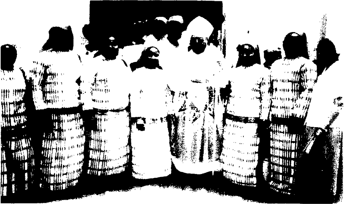
Cross section of the Sisters with their Founder