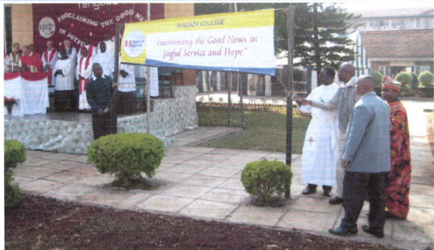
The banner displaying the Jubilee theme is unveiled.