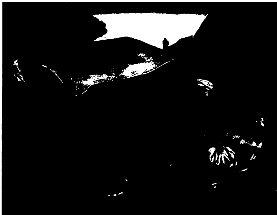
Good Samaritan is Helping the Wounded Man