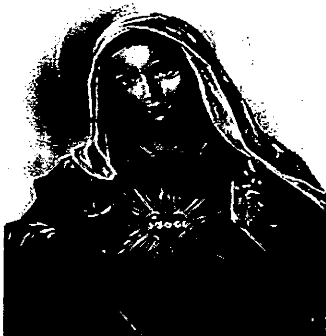
The Mother of the Redeemer and the Redeemed