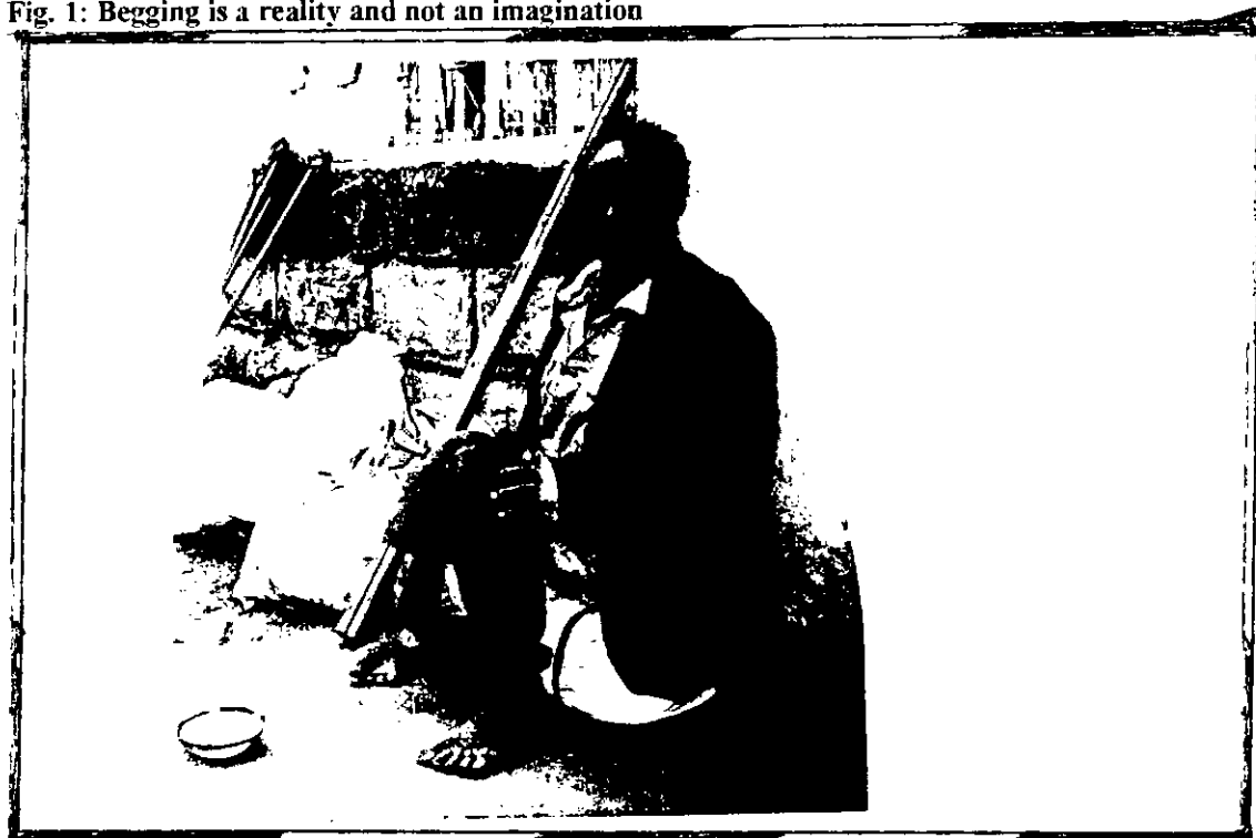
Fig. 1: Begging is a reality and not an imagination

This man is a street beggar in Nairobi. He came to the streets after his brothers drove him out of their ancestral land