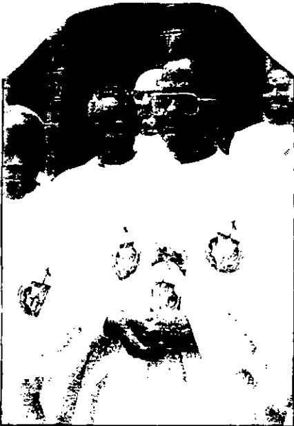
Bishop John Njue, Chairman of Kenya Episcopal Conference.