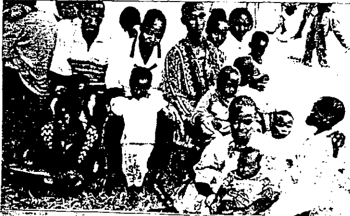
Fig. 6: Examples of some rehabilitation homes (Source: The Seed, Vol. 10, No. 12, 1998).

Nyumbani, is the Institute that realizes the vision of Fr. Angelo D'Agostino to care for HIV positive and abandoned orphan infants.