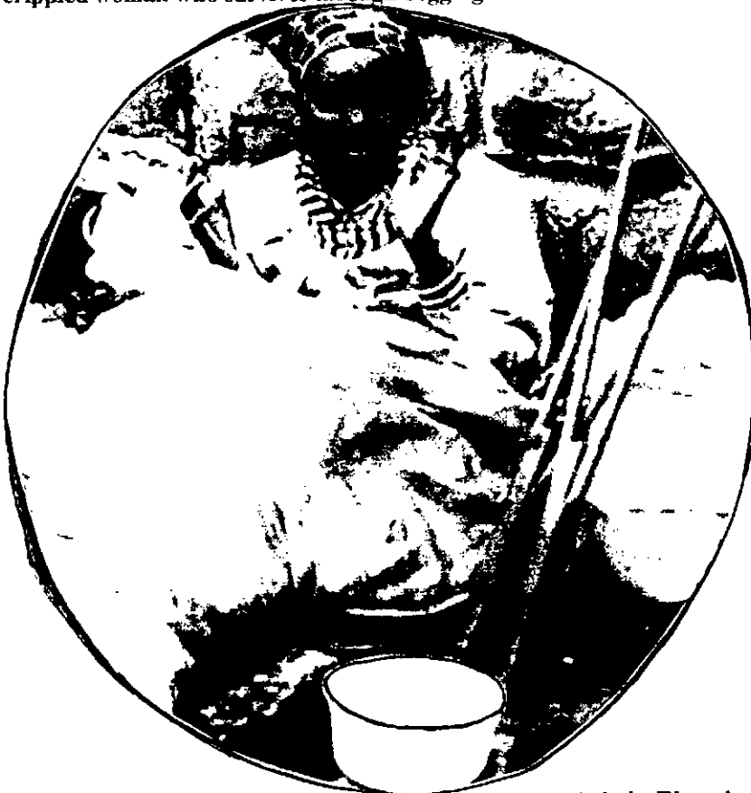
She says her main aim of begging is in order to purchase a wheel chair