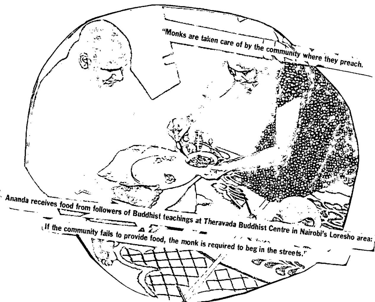
Fig. 5: A Monk who survives through the kindness of those he serves

door, rather than those given spontaneously 30 . To lead a poor life, owning nothing was a matter of choice for many religious men and women of the time and even today. Their inner motivation was to experience the sufferings of Jesus and share in his humiliation so as to experience that inner consolation from God which can only be experienced by those who fully surrender themselves to him. Such people made a choice to live by begging just like the Buddhist Monk shown in the picture below.