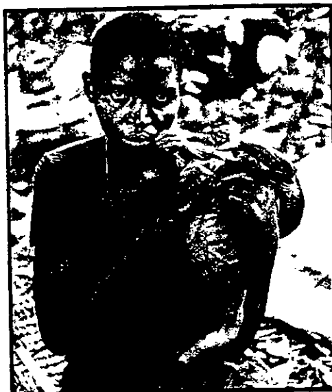
Rwandan mother and child near the village of Biaro in Eastern Zaire, 1997. (Photograph by Sebastiao Salgado)

Source: Universal declaration of human rights, 1948- 1998.