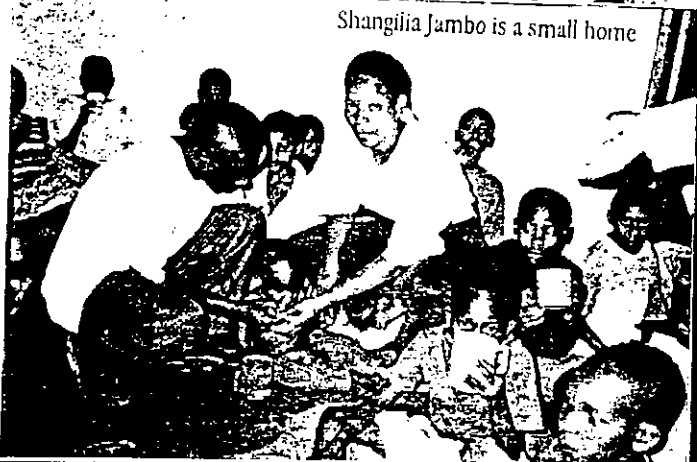
Shangilia Jambo is a small home