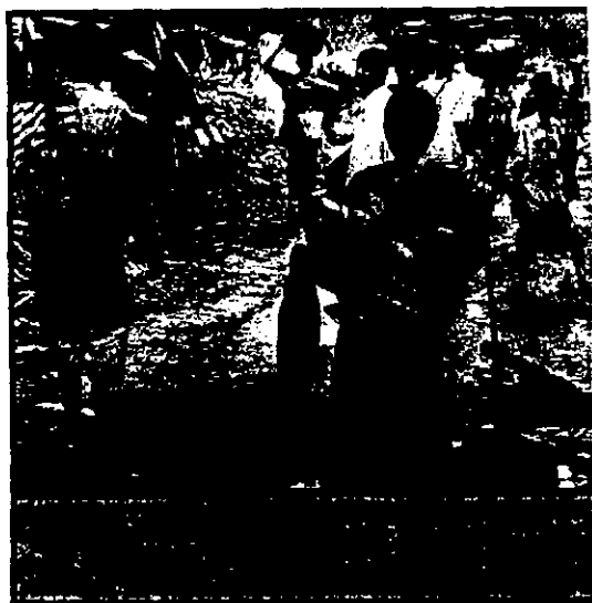
Fig. 4: War victims who survive through the help of others.

In conclusion we can say that, begging is a real issue that is both a threat and a challenge to the society. The problems that lead to such a destitute state can come upon any one, rich and poor alike. Although different kinds of beggars have been mentioned in this essay, it is in the view of this research that material beggars are on the increase. By asking for money, food and so on one already becomes a beggar. However, begging can be very humiliating but to those used to it, they grow to be dependant upon others which is at times a bother.