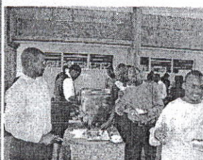
It wasn't just women affairs