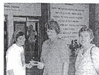
Women of Substance