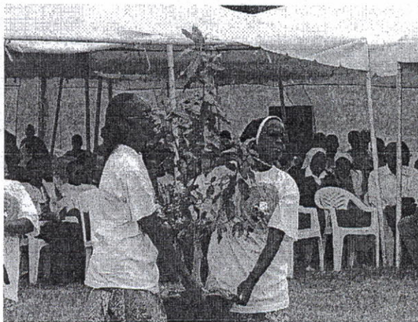
Youth Ministers presents symbols during the Mass