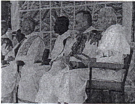
Pastors of the Church