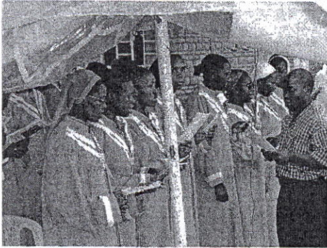
The Choir was good indeed!