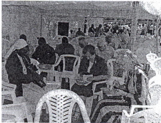
Ok, let's eat!